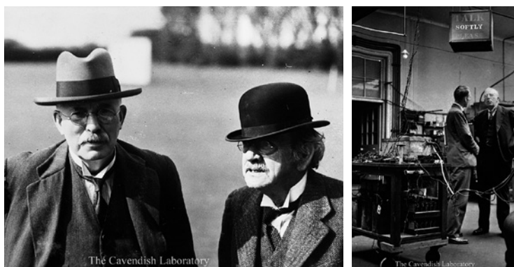
Figure 3: Photographs from the Cavendish Laboratory Collection. The image on the left is »Rutherford and JJ Thomson at the annual cricket match (1936)« (P203); on the right is »Talk Softly Please« (P184).