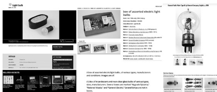
Figure 1: The representations of light bulbs in three digital collections: the Science Museum Group, the Collection of Historical Scientific Instruments (Harvard University), and the History of Science Museum at the University of Oxford.

This paper is concerned mainly with the latter point: connectivity and linkage. 4 The capacity to model and represent the connections between items is a hallmark of a digital collection, unlike the traditional archive. The digital archive owes this power to its technical dispositif , as detailed in Media Archaeology and Digital Memory Studies. 5 The traditional archive seeks to preserve things in their integrity and original form; the digital archive operates not with things in their entirety but with discrete bits and pieces, with zeros and ones, devoid of any semantics per se, yet open to manipulation. Digital collections thus sacrifice the alluring goût de l'archive 6 for creating unprecedented forms of access and modeling the past. The power to establish relations between objects is one of the manifestations of these new capacities.