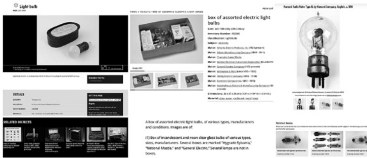
Figure 1: The representations of light bulbs in three digital collections: the Science Museum Group, the Collection of Historical Scientific Instruments (Harvard University), and the History of Science Museum at the University of Oxford. Courtesy of and copyright by the Science Museum Group, the Collection of Historical Scientific Instruments (Harvard University), and History of Science Museum at the University of Oxford. Screenshots taken by the author, January 2023.

This paper is concerned mainly with the latter point: connectivity and linkage. 4 The capacity to model and represent the connections between items is a hallmark of a digital collection, unlike the traditional archive. The digital archive owes this power to its technical dispositif , as detailed in Media Archaeology and Digital Memory Studies . 5 The traditional archive seeks to preserve things in their integrity and original form; the digital archive operates not with things in their entirety but with discrete bits and pieces, with zeros and ones, devoid of any semantics per se, yet open to manipulation. Digital collections thus sacrifice the alluring goût de l'archive 6 for creating unprecedented forms of access and modeling the past. The power to establish relations between objects is one of the manifestations of these new capacities.