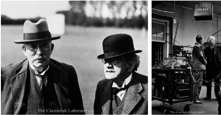
Figure 3: Photographs from the Cavendish Laboratory Collection. The image on the left is »Rutherford and JJ Thomson at the annual cricket match (1936)« (P203); on the right is »Talk Softly Please« (P184).